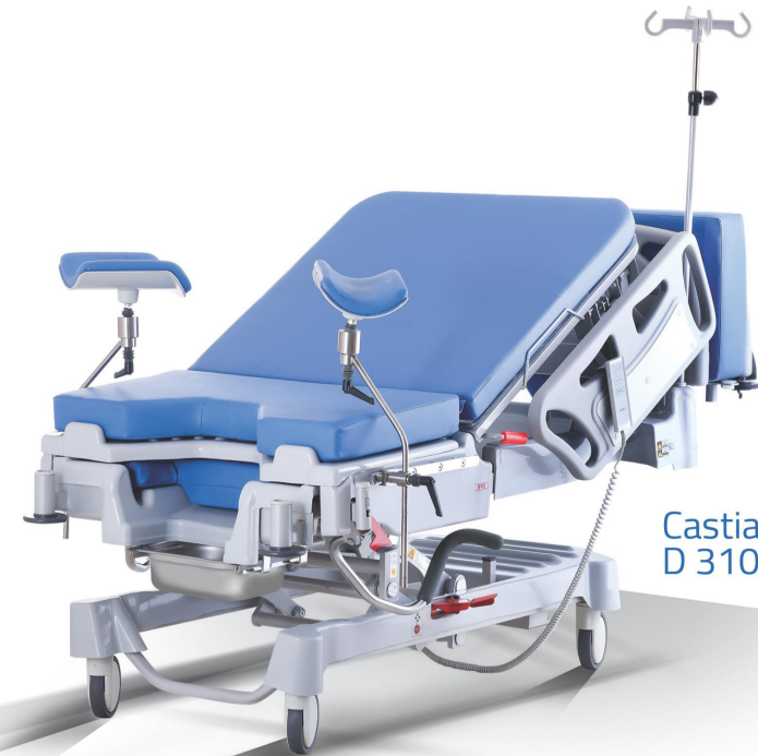
Castia Series D 3101 poc

Height and trend . / Rev . trend and backrest are adjusted by means of 3 actuators and 3 - Function handset . CPR handle is available at both sides of the CASTIA for flattening bed rapidly . 4- segment mattress is washable and disinfected . Footboard and leg - section mattress are removed in lithotomic position. Those are placed behind the headboard . At this position leg - section is placed under the seat .