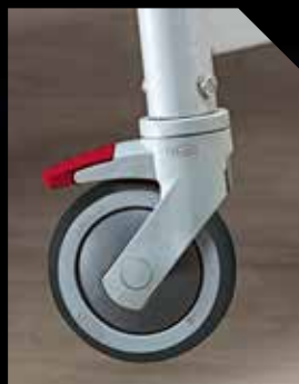
● Independent break castors