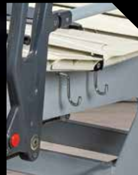
● Urine bag holder