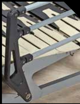
● Plastofold sideboard