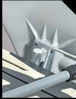
● Traction holder