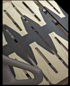
● Puzzle shaped platform