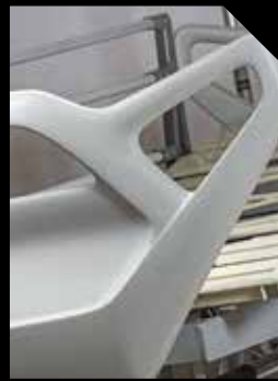
● Plastic head / foot board with metal connection