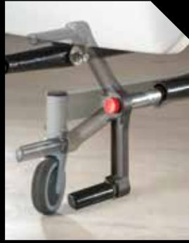
● PUSH - PUSH crank for kneeraise and backrest adjustment